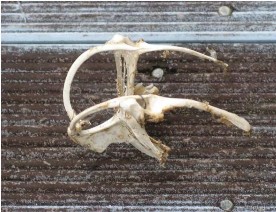
Bird Skeleton

The child has found a perfect circle of white bone. It's delicate and strong. She brings it home.