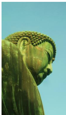
Nembutsu, Kamakura

Most of our life is taken up with thoughts of the past or dreams about the future, and all of these focus on the "I" as ego. In concentrating on the ego, and its desire for security, we lose sight of our true nature.