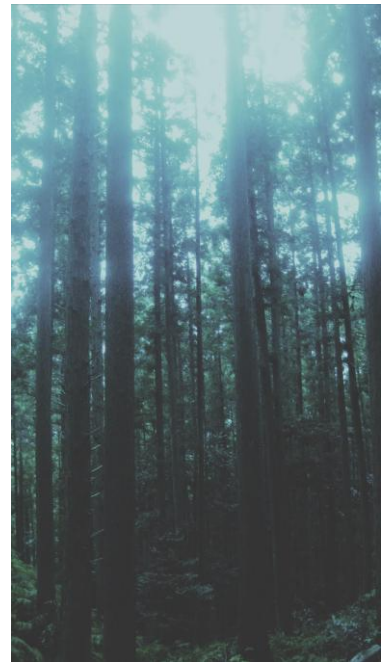
Old Trees, Kumano Kodo Trails

*Written for Mona Wurtz who died of stomach cancer at Sangsurya in October 2005.