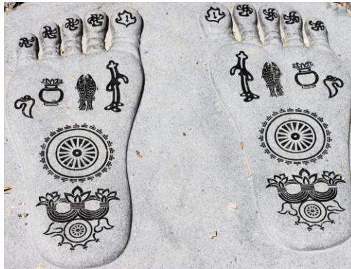
Buddhapada, Mt. Fuji.

When I was asked to do this talk it was difficult to come up with something that I thought would be suitable. When I thought about it I realised that I have a deep sense of not knowing, not knowing anything, and this is the very nature of Zen.